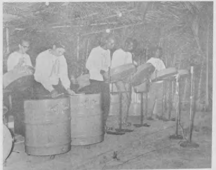
J F K Steelband - 3rd Place Winner